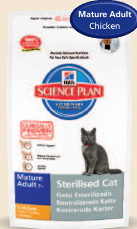
Mature Adult Chicken