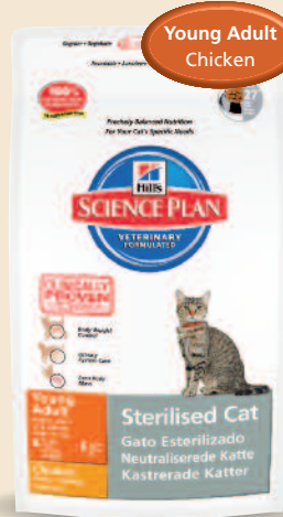
Young Adult Chicken

Hill's™ Science Plan™ offers a precise formula that reduces the risk of your sterilised cat developing health problems: